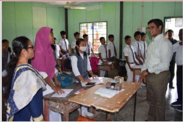
Chief Secretary's visit to Katchal Island

Tomorrow (Feb.9), the Chief Secretary will visit