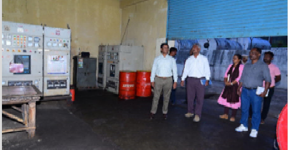
Chief Secretary's visit to Kamorta Island