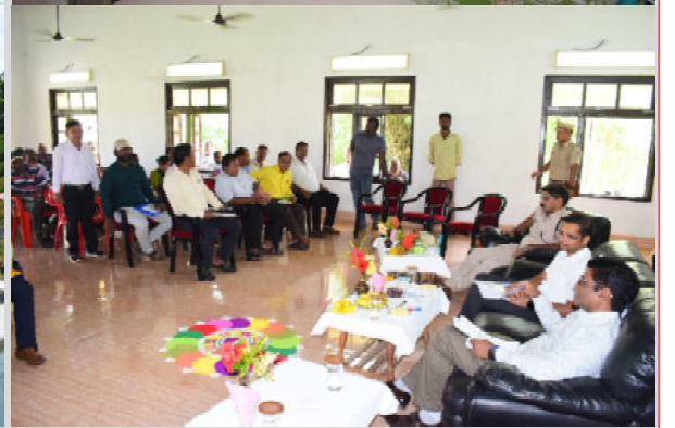
Chief Secretary's visit to Katchal Island