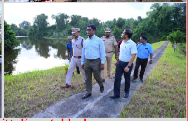
Chief Secretary's visit to Kamorta Island

students of Class X & XII appearing for CBSE exam. He directed APWD to undertake immediate repair of staff quarters and school building. The Chief Secretary also visited the Anganwadi Centre.