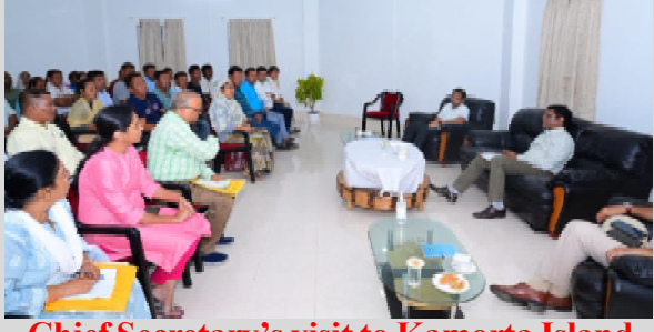
Chief Secretary's visit to Kamorta Island

Munak Island and proceed to Campbell Bay. At Campbell Bay, he will visit School, AWC, Power House etc. He will also inspect road construction work upto Indira Point and sites in connection with Great Nicobar Island Project.