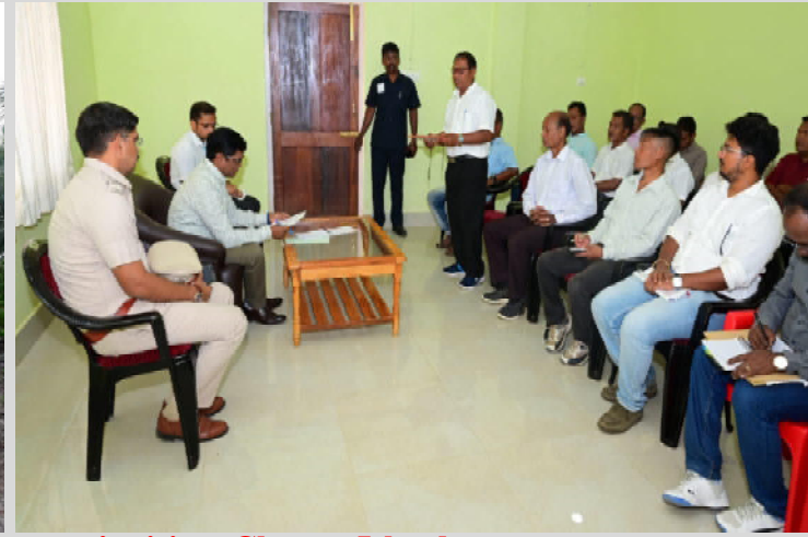
Chief Secretary's visit to Chowra Island